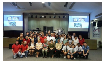
CHR Alumni Homecoming @ Dorset on 17 August, Saturday

Dear CHR students, trainees and partners, CHR is providing a platform to groom talents of various performing arts. We have seen more students, trainees and staff coming forward to sing, to play guitar, piano, drum and etc. We also have more supporters like students and staff coming forward to enjoy the session.