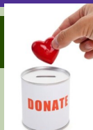
Ezekiel 34:26 I will make them and the places surrounding my hill a blessing. I will send down showers in season; there will be showers of blessing.

Please make your cheques payable to 'Christ Church Secondary School' & send to Christ Church Secondary Sch., 20 Woodlands Drive 17, Singapore 737924. Indicate at the back of the cheque: for CHR Healthy Leisure Zone.