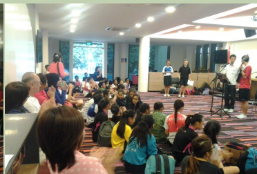
Students and staff enjoying CHR Groovin' Jamboree session