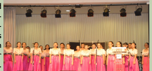
Choir presentation during CHR Alumni Homecoming @ Dorset on 17 Aug 2013

Christ Church Choir (CHR Choir) was established in 2004 as a performing arts group for singing enthusiasts. The CHR Choir had a humble beginning, starting with only 15 - 20 members. But now it has grown to be a three-part SSA choral ensemble with 40 active members. It has clinched bronze and silver awards during SYF 2009 and SYF 2011 respectively. In this year 2013 it has clinched a Distinction for SYF Arts Presentation .