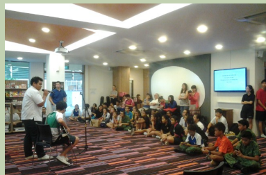
Student sang along with guitarist at CHR Drop-In-Centre (DIC) on 26 Jul

Every Tues for Maths and Thurs for Science, Social Studies, Literature & English 6-8pm