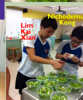
Making Salad Using Harvested Vegetable