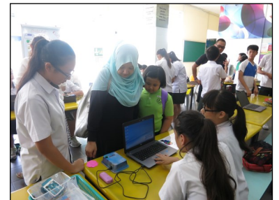
A parent trying the heart-rate sensor

On ALP day, I had the opportunity to showcase my product to visitors and parents. I had created a heart rate sensor which calculates the heart rate and displays the reading on a LCD screen. It was great seeing others try my sensor and giving me feedback on how to improve. Through this experience, I learnt to be persevering and not succumb to challenges that I may face.