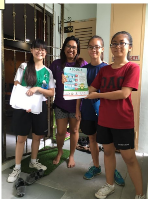
Students from OAC distributing flyers on saving the environment to residents.

I participated in the Reduce @ North West programme by making house visits to flats near my school to give them flyers on how to save the environment and to encourage them to sign a pledge to save energy. It was very rewarding when some residents signed the pledge. I felt that I had done my part to promote the importance of saving the environment.