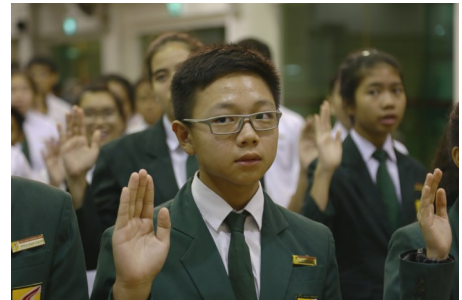
Student Councillors reciting the Student Leader's pledge