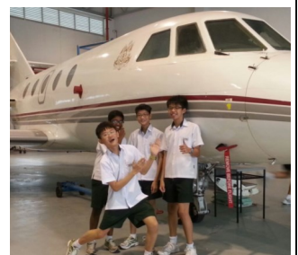
1E2 boys having a blast during the learning journey