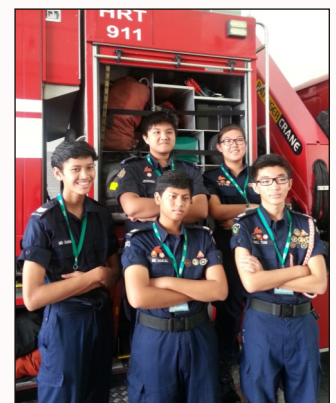
NCDCC students at DART