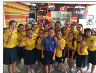
Girls' Brigade Students

Guess why are the Girls' Brigade students beaming from ear to ear? Find out in Issue 7!