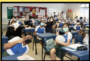
2/4 enjoying their Honours Day (Staff) celebrations in the classroom.