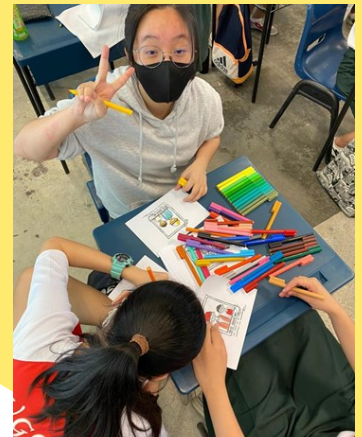
Getting our creative juices flowing while designing the bags.