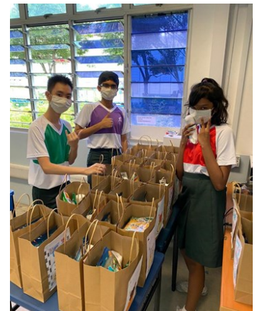
The care packs ready to be distributed to the migrant workers.