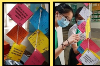
Students reading through the appreciation notes.